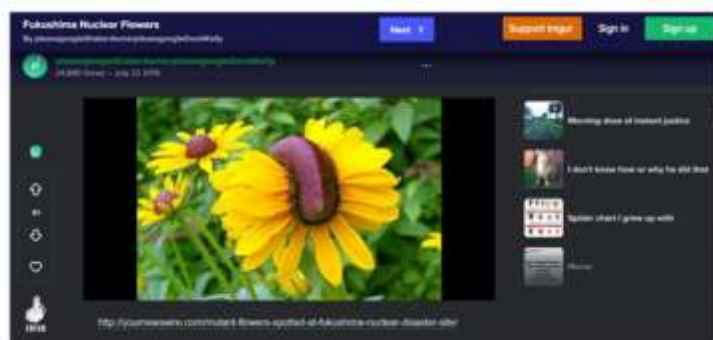
Figure: 1 Visual Evidence Analysis Task

In the first task of the online critical literacy assessment, the preservice teachers were asked to evaluate the visual information posted in Imgur, an image-sharing website. In 2015, a person uploaded a picture of malformed daisies in Imgur. This picture became popular on Twitter and was shared by hundreds of people claiming that the nuclear facility in Fukushima Daiichi leaked radiation to the environment and caused environmental damage, as seen in this figure 1.